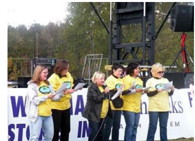
Perrin faculty performs "I Will Survive" at North Oaks Park for Relay for Life.

Perrin Faculty And Staff Wishes everyone a Happy Holiday And a Safe and Prosperous New